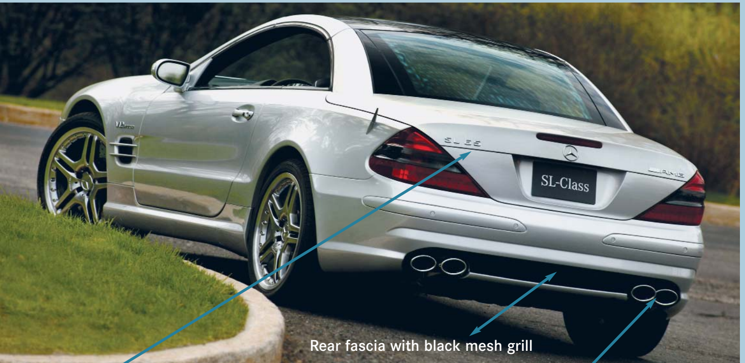
SL65 AMG badging