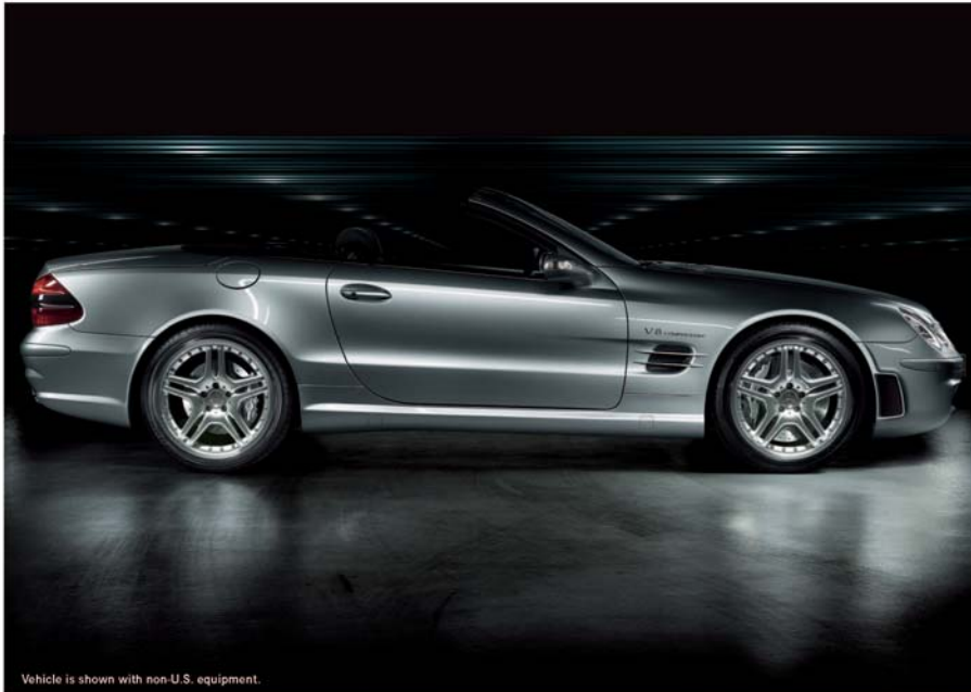
Vehicle is shown with non-U.S. equipment.