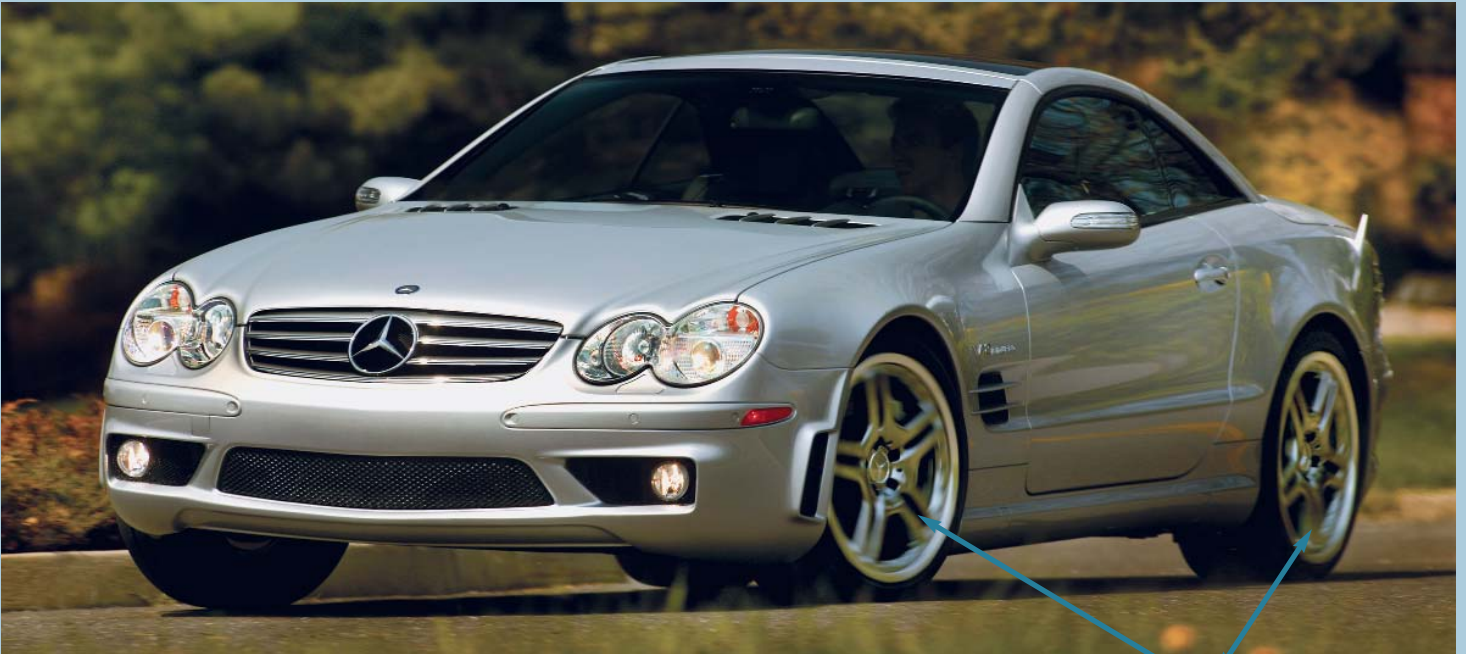
AMG 19" twin-spoke multi-piece alloy wheels