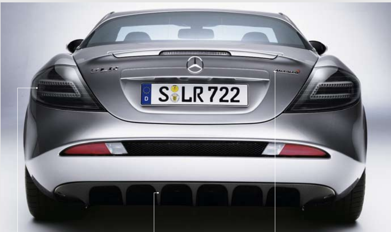
Darkened rear lights with palladium grey indicator modules