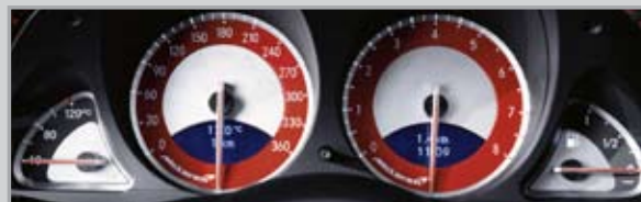
Modified instrument cluster with red surrounds including AMG RACETIMER