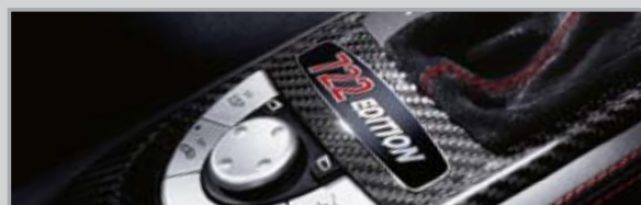
Carbon fiber interior trim and "722 Edition" badge