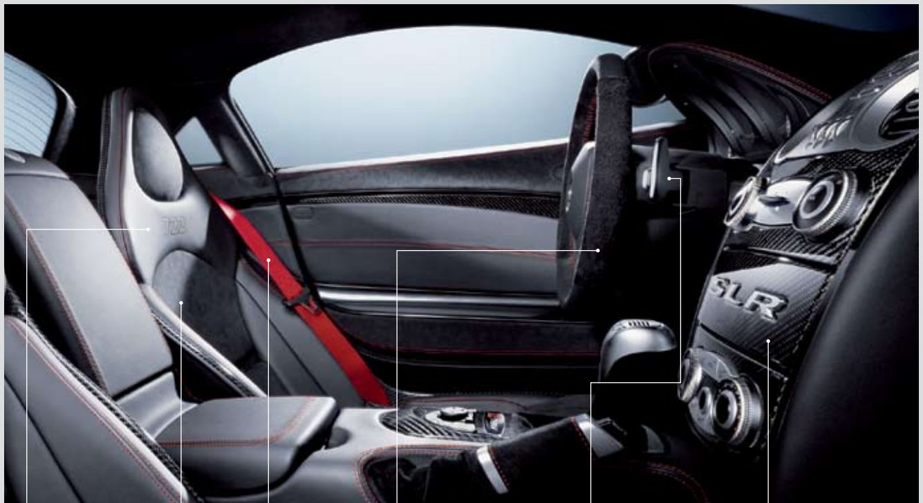
"722" embossing on seat back