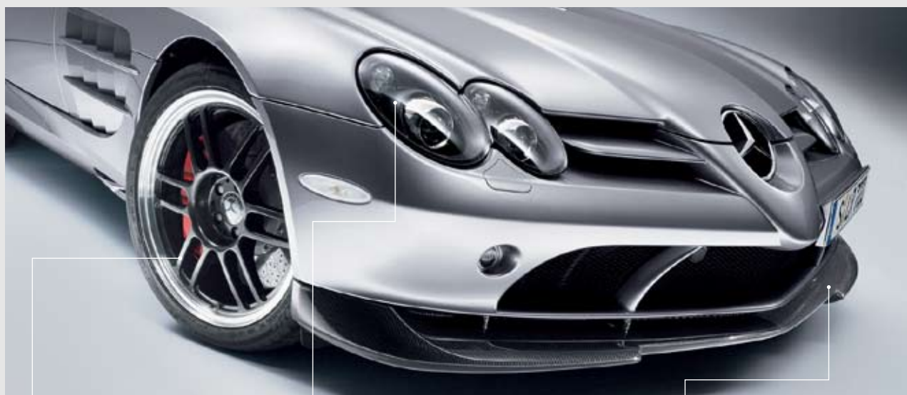
19" forged aluminum wheels