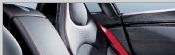
Red contrasting stitching and red seat belts