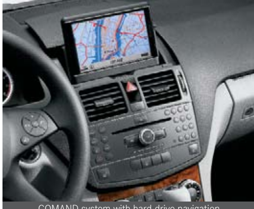
COMAND system with hard-drive navigation and in-dash 6-disc DVD/CD changer