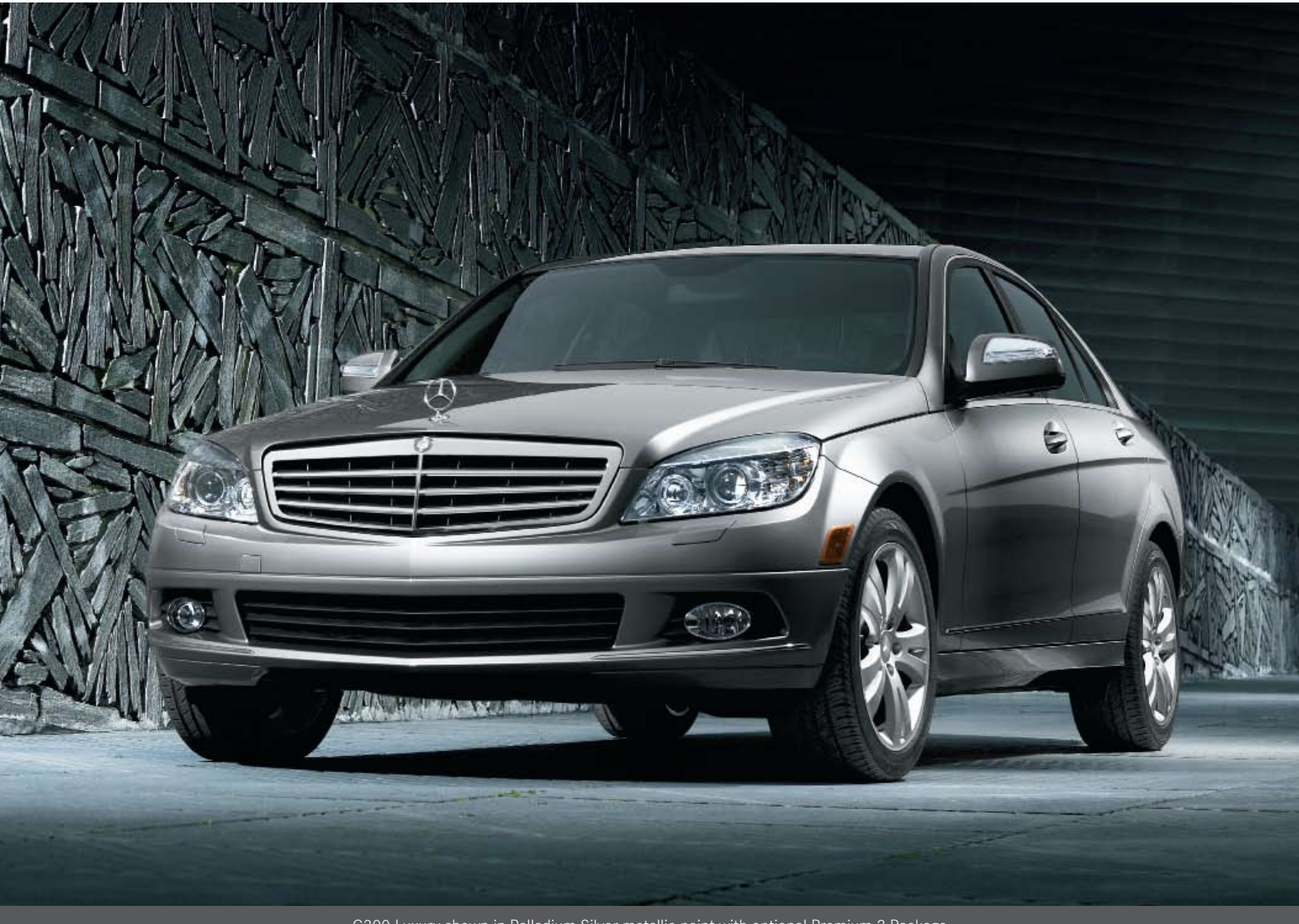
C300 Luxury shown in Palladium Silver metallic paint with optional Premium 2 Package