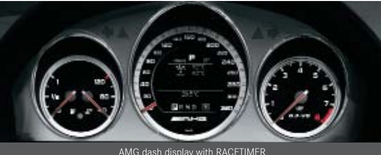
AMG dash display with RACETIMER