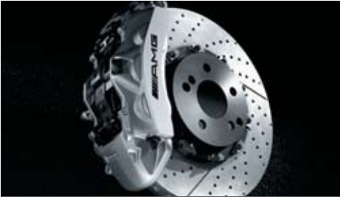
AMG compound braking system