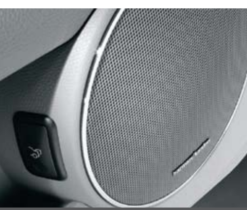
harman/kardon LOGIC7<sup>®</sup> surround-sound system with Dolby digital 5.1