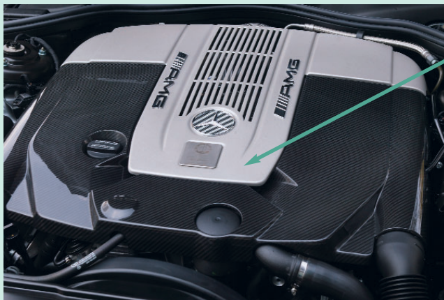
AMG 6.0 liter V-12 BiTurbo engine