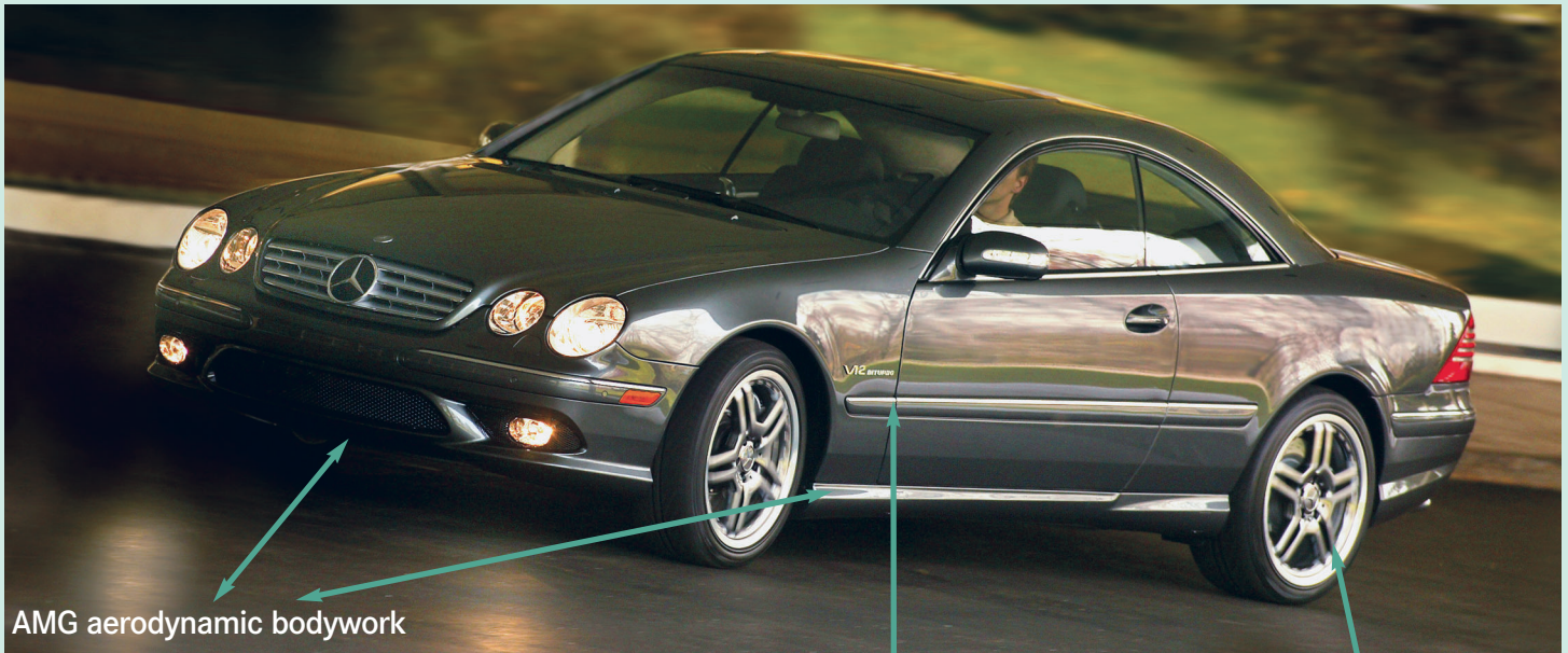
AMG aerodynamic bodywork