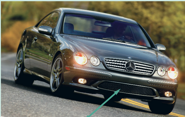
Front apron with enlarged air intake and black mesh grill