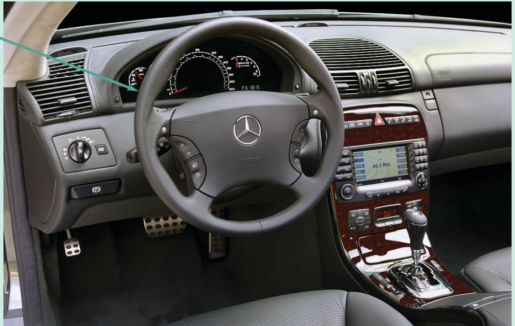
AMG Sport steering wheel with gearshift buttons