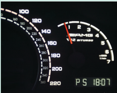
AMG Instrument Cluster with 220 mph speedometer and V-12 BiTurbo badging