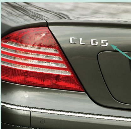
CL 65 AMG badging