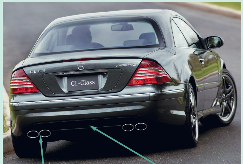
V-12 AMG Sport Exhaust with chrome dual exhaust pipes