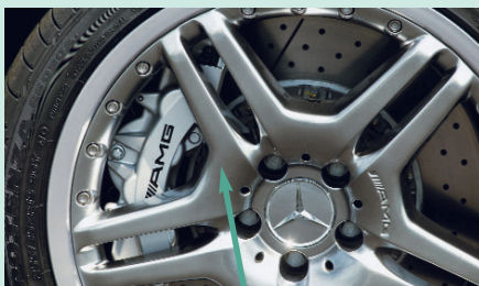
AMG 19" wheel with ventilated Compound Disc and AMG caliper