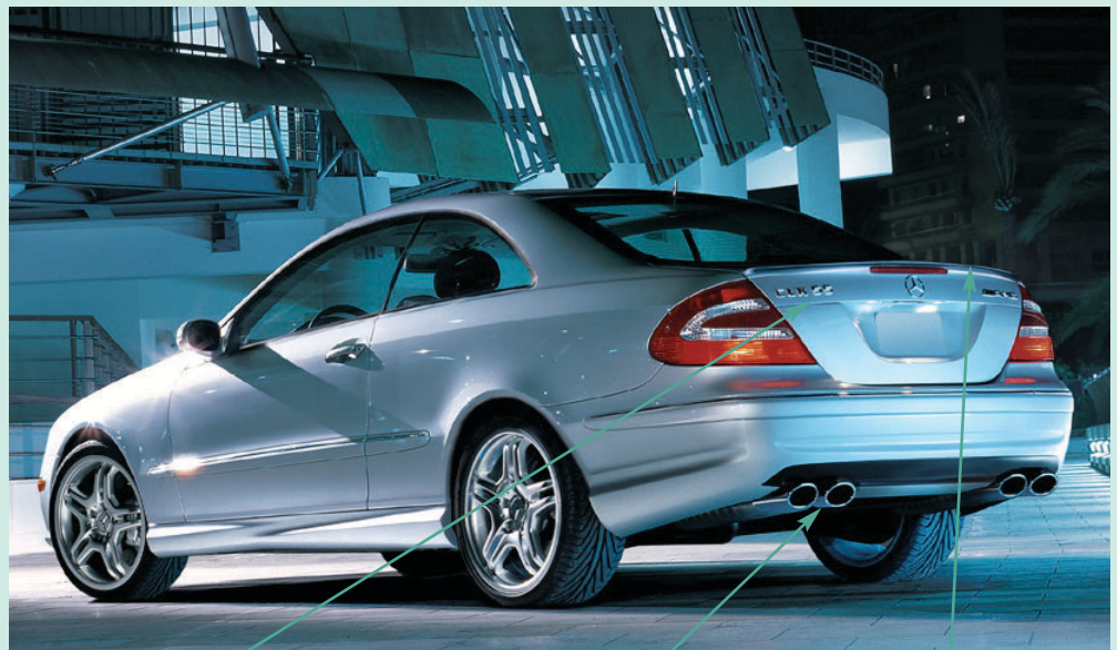
CLK55 AMG badging