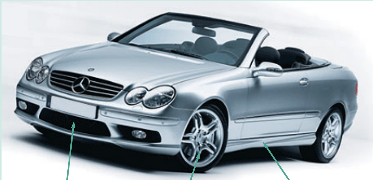
AMG-designed front air dam