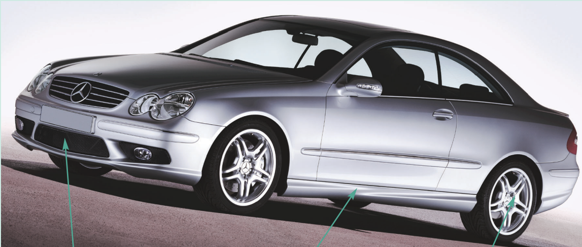
AMG-designed front air dam