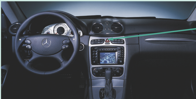
CLK55 AMG Coupe interior shown here

AMG Nappa/Nubuck leather upholstery in 3 color combinations (Ash Nappa leather available as additional upholstery choice for CLK55 AMG Cabriolet only)