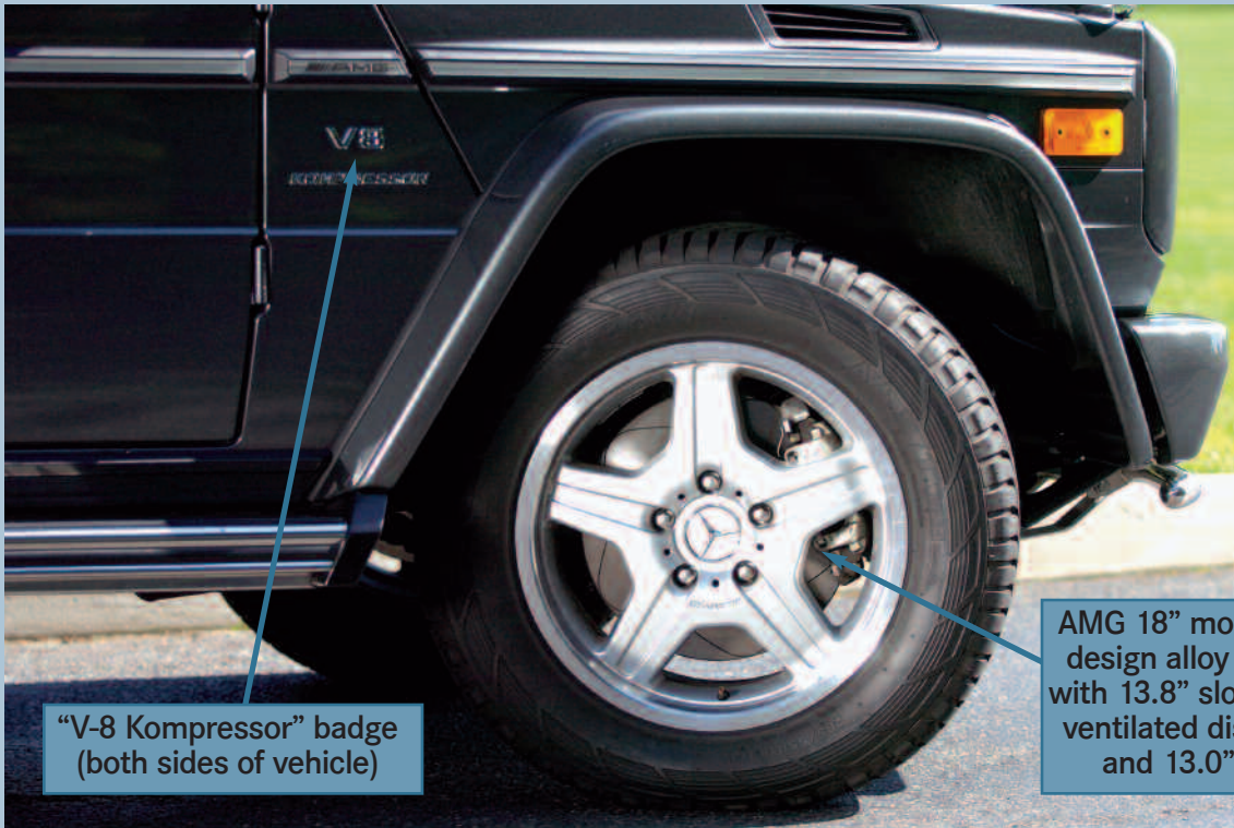
"V-8 Kompressor" badge (both sides of vehicle)