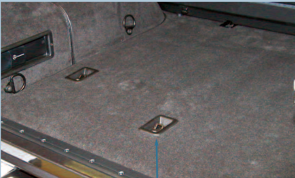
Improved ISOFIX Tie Downs