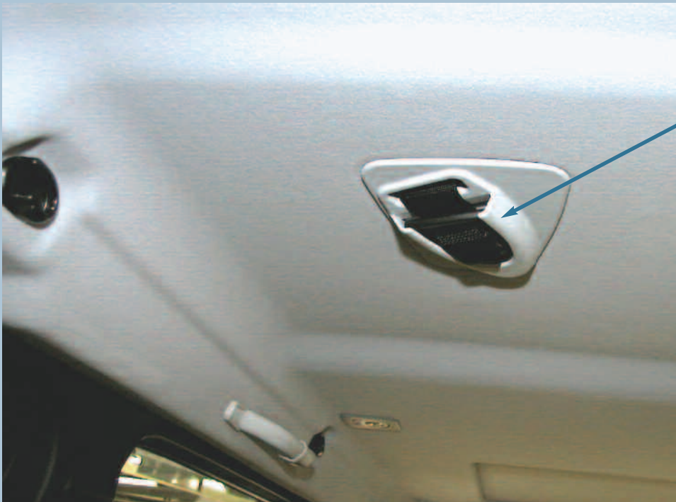
Three Point Safety Belt for third person in Second Row (Middle Seat)