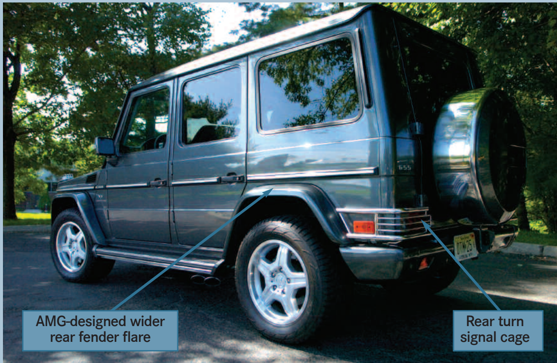
AMG-designed wider rear fender flare