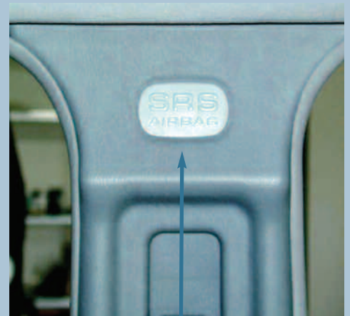
Window Curtain Bags for Front and Rear Side protection