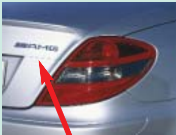
AMG trunk badge