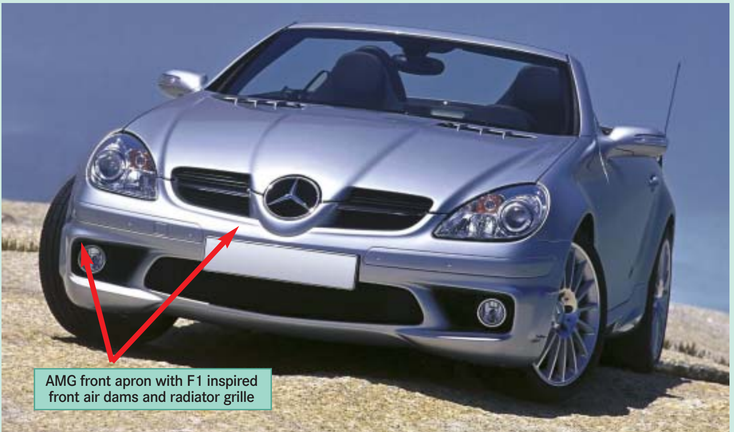
AMG front apron with F1 inspired front air dams and radiator grille