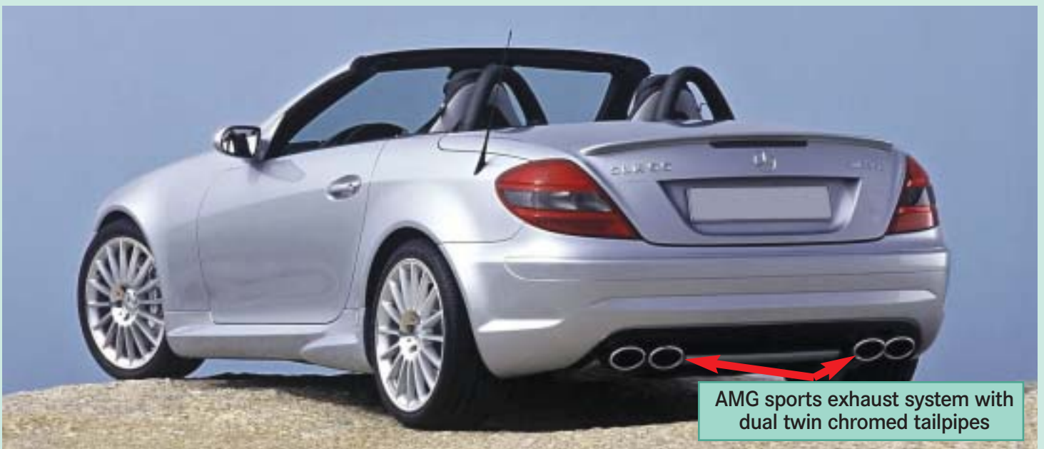
AMG sports exhaust system with dual twin chromed tailpipes