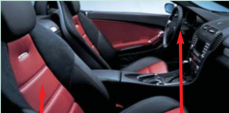
AMG Red/Black upholstery