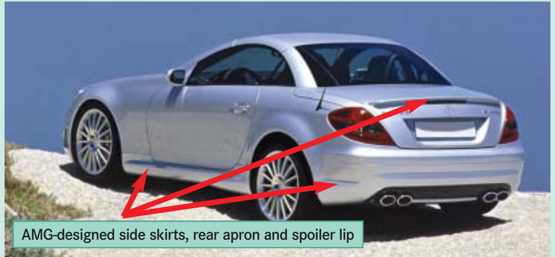
AMG-designed side skirts, rear apron and spoiler lip