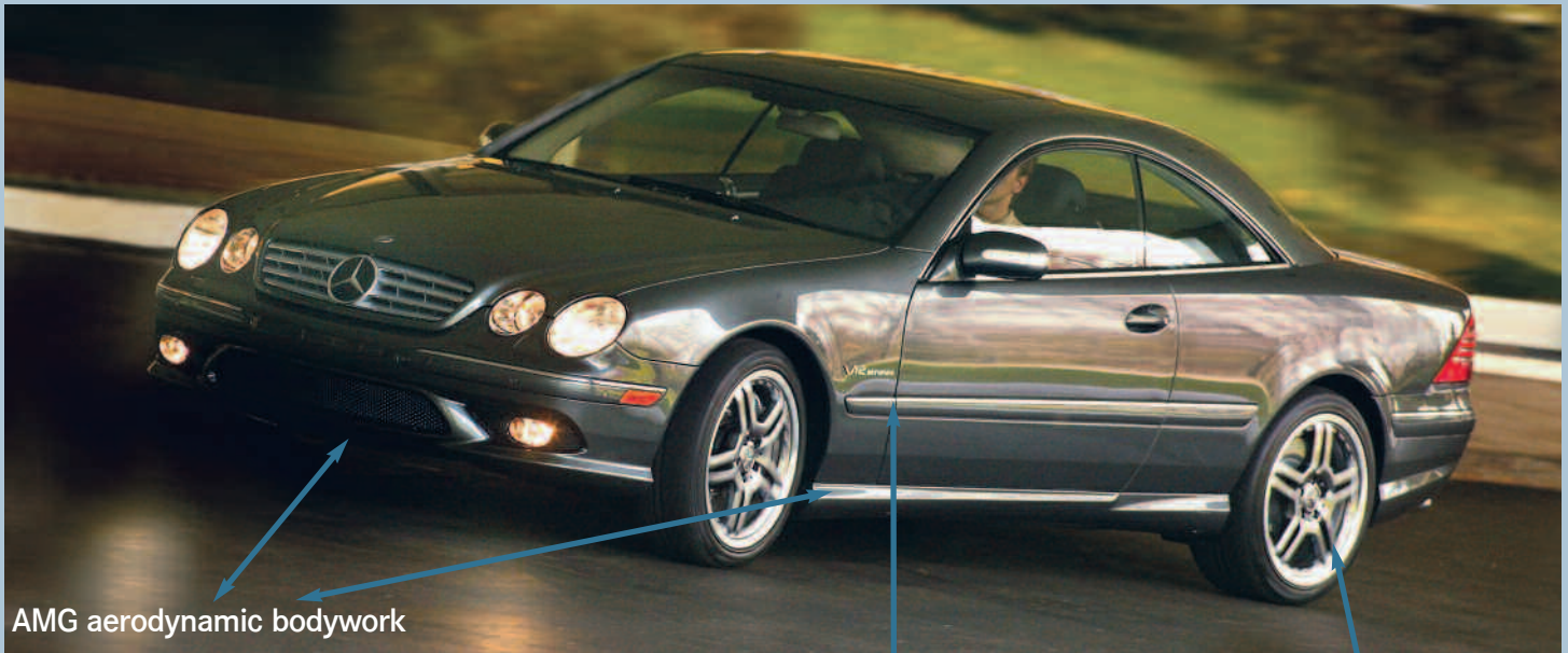
AMG aerodynamic bodywork