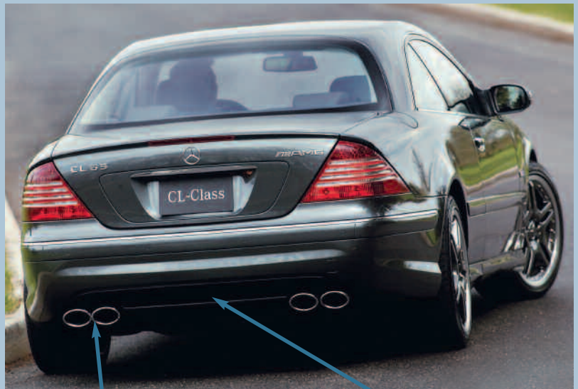
V-12 AMG Sport Exhaust with chrome dual exhaust pipes