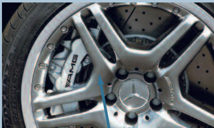
AMG 19" wheel with ventilated Compound Disc and AMG caliper