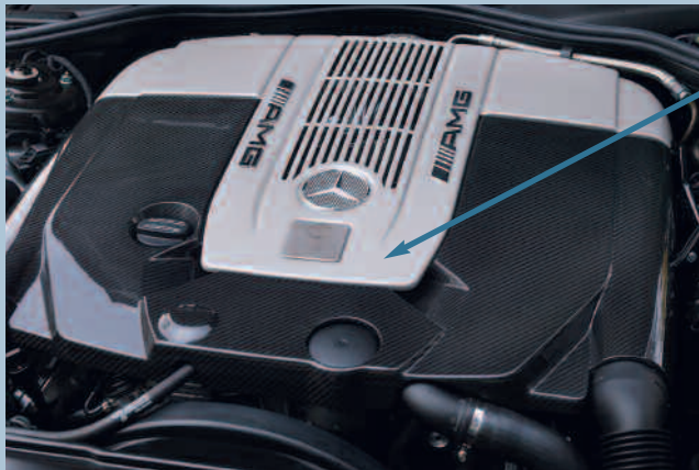
AMG 6.0 liter V-12 BiTurbo engine