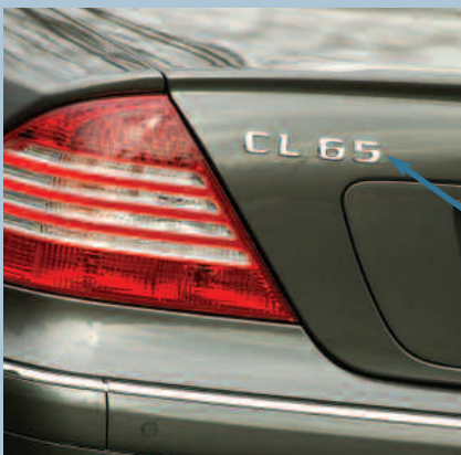
CL 65 AMG badging