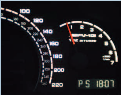
AMG Instrument Cluster with 220 mph speedometer and V-12 BiTurbo badging