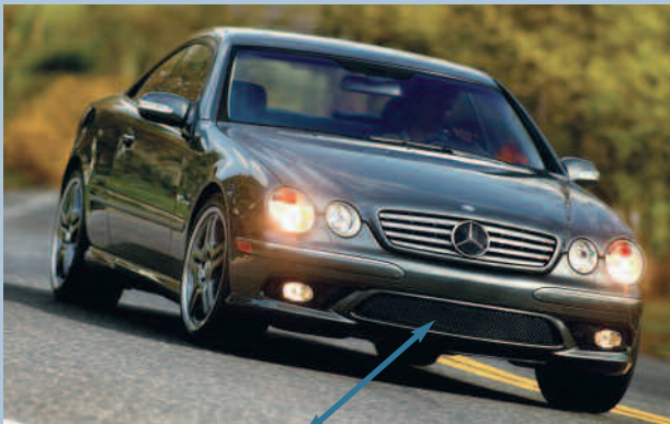
Front apron with enlarged air intake and black mesh grill