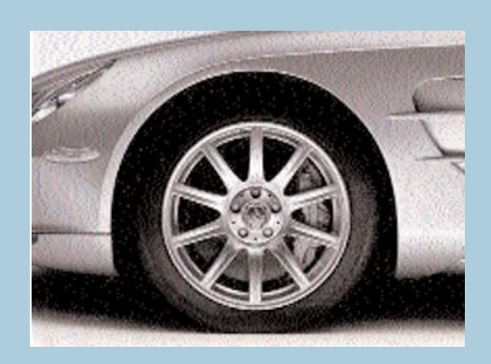
Code R34 18" 10-spoke design alloy wheels (no cost option)

Wheels / Tires Front 9.0" x 18"245/40ZR18 Rear 11.5" x 18" 295/35ZR18