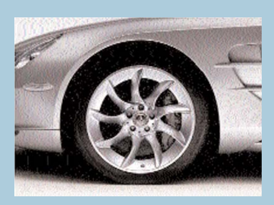
Code R37 19" Asymmetric turbine design alloy wheels (standard)

Wheels / Tires Front 9.0" x 19" 255/35ZR19 Rear 11.5" x 19" 295/30ZR19