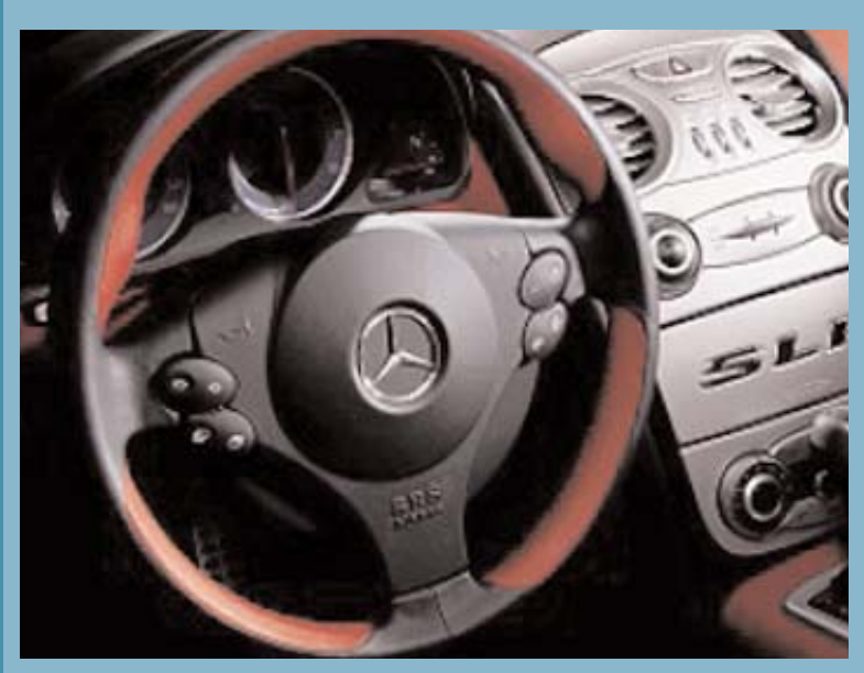
L31- Two-tone Steering Wheel

**Can only be ordered with Silver-Arrow Leather Upholsteries Not available with Standard Leather Interiors (Codes 511, 517, 518)