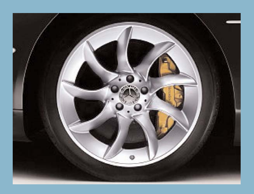
U69- Brake Calipers Painted in Gold