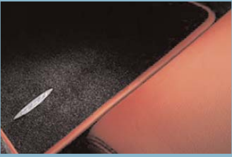
L32- Floor Mats with contrasting leather piping