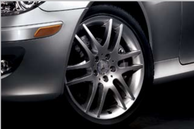
17" 6-Twin-Spoke Wheels (Appearance Package)