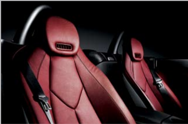
AIRSCARF Neck-level Heating System