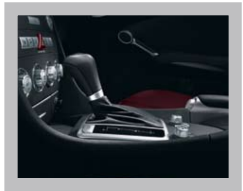
427 7-Speed Automatic Transmission