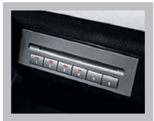
819 CD Changer