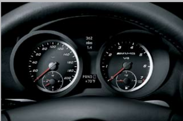
New AMG Instrument Cluster with RACETIMER