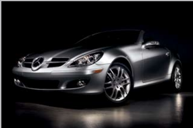
Appearance Package (Exterior)