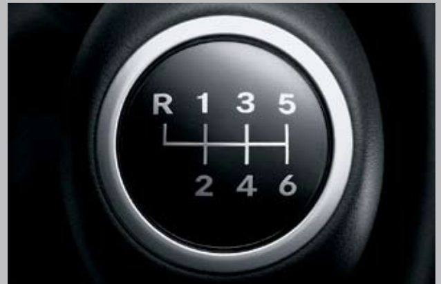
6-Speed Manual Transmission