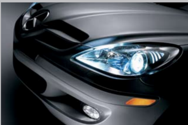
Optional Bi-Xenon Headlamps