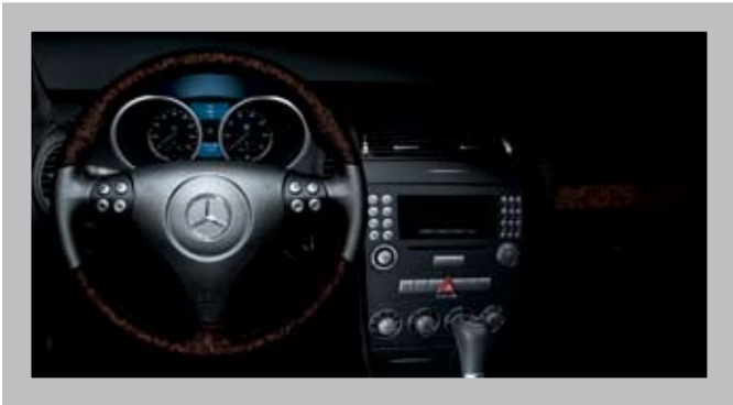
Vavona Wood Trim