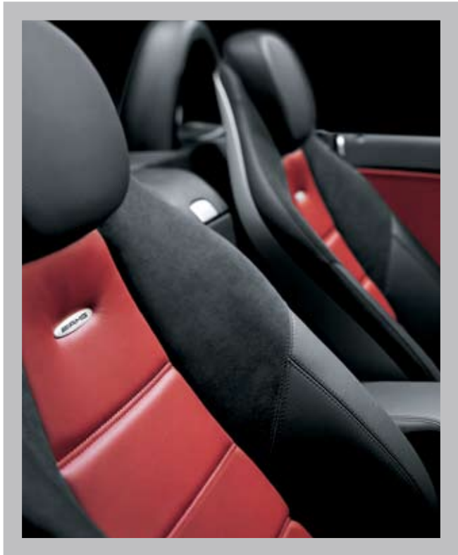
AMG Two-Tone Nappa Leather Upholstery