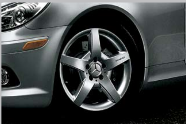
17" 5-Spoke AMG Alloy Wheels