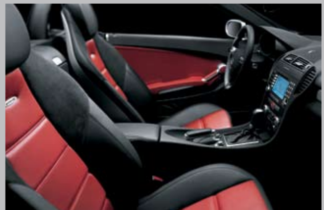
AMG Two-Tone Nappa Leather Upholstery