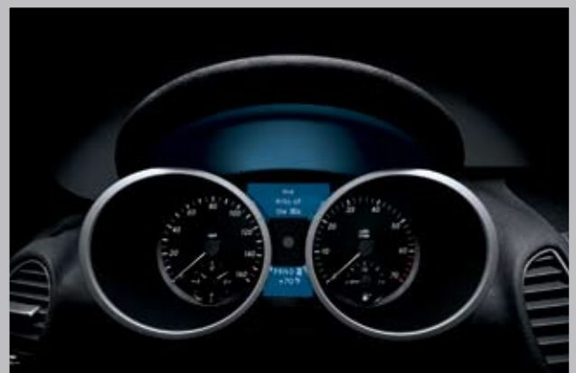
Instrument Cluster with Dual Multi-Function Display