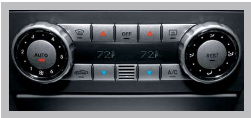
581 Digital (Dual-Zone) Automatic Climate Control