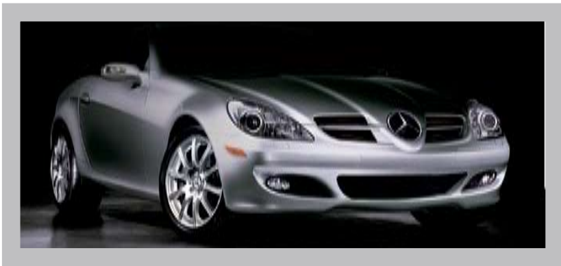
(A) Metallic Paint

O = Optional Equipment S = Standard Equipment -* = Part of Option Package Only - = Not Available