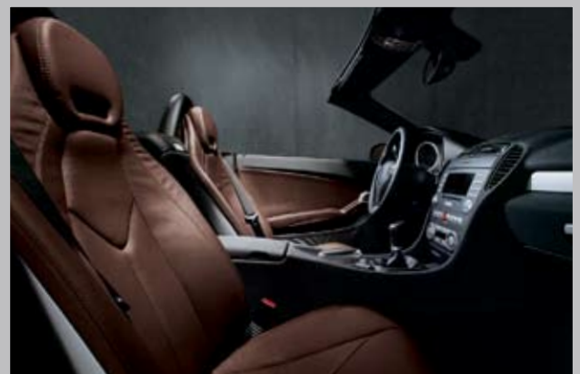
Optional Brown Nappa Leather