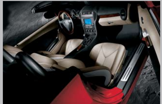
Appearance Package (Interior)