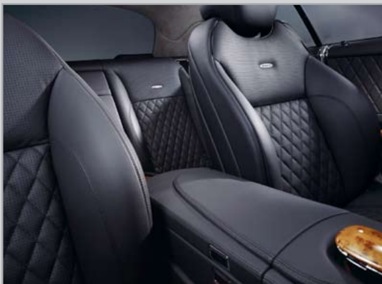
AMG Sport Seats with AMG V12 Diamond Pattern