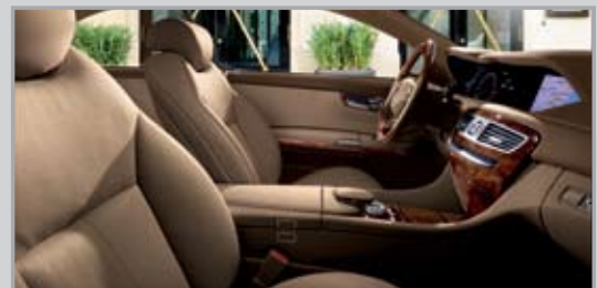
Premium Leather Upholstery with Gloss Dark Burl Walnut Wood Trim and Wood/Leather Steering Wheel