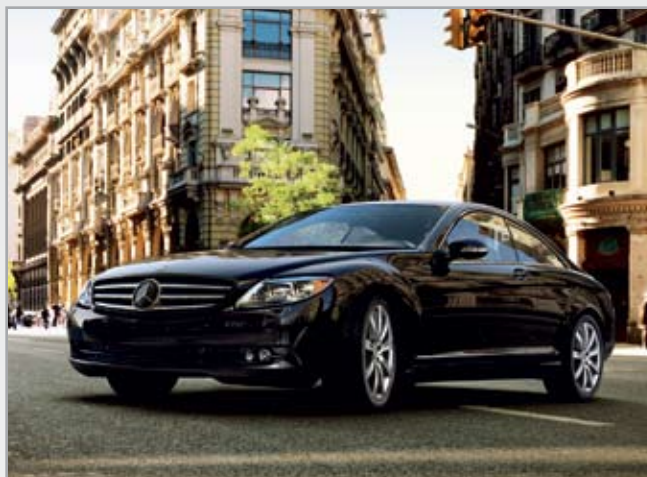
CL 550 shown in Majestic Black Metallic Paint