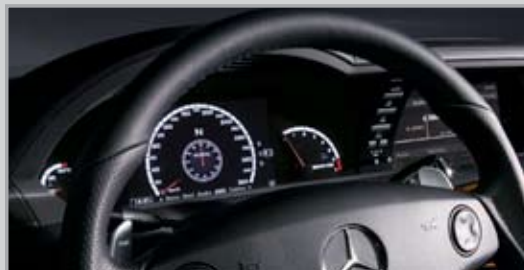
AMG Instrument Cluster