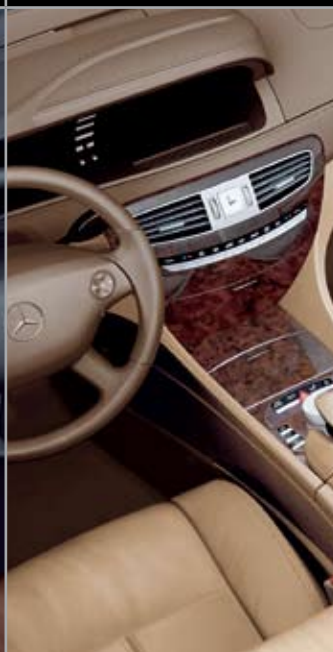
CASHMERE /SAVANNA UPHOLSTERY WITH DARK BURL WALNUT TRIM