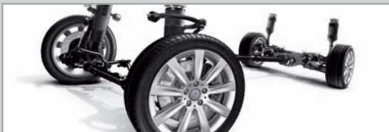
Active Body Control (ABC) Suspension