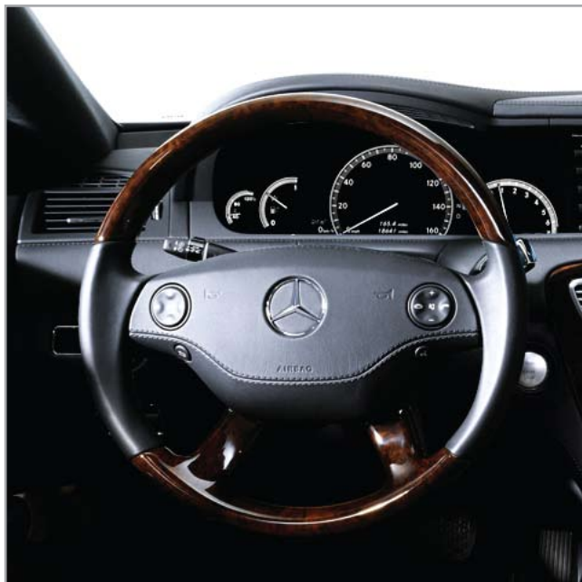
443 Heated Steering Wheel