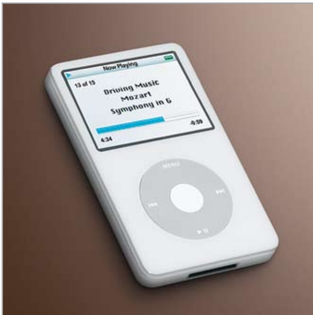
057 iPod Integration Kit