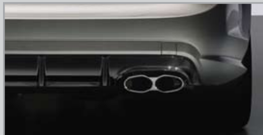
Carbon Fiber Rear Diffuser Application