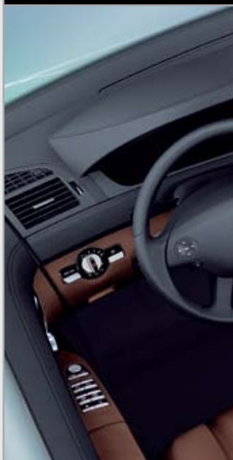
COGNAC /BLACK UPHOLSTERY WITH DARK BURL WALNUT TRIM