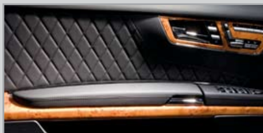
AMG V12 Diamond Pattern Door Lining