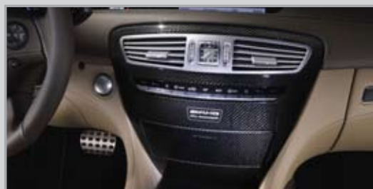
Exclusive Leather Upholstery and Trim