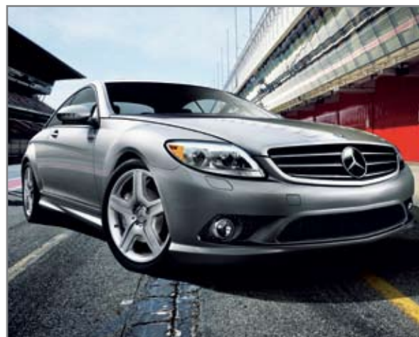
AMG Body Styling