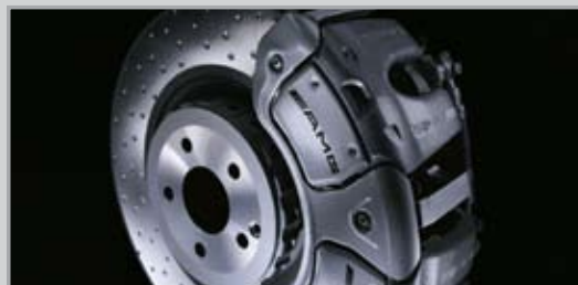
AMG High-Performance Braking System