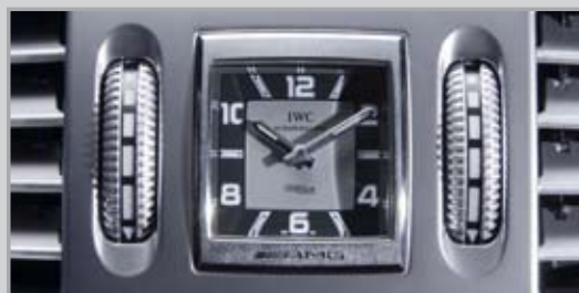
AMG Analog Clock