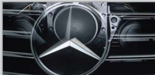
Distronic PLUS with Parking Guidance and Blind Spot Assist