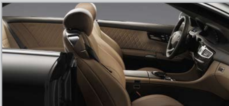
“40th Anniversary Edition” Upholstery