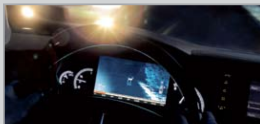
Night View Assist