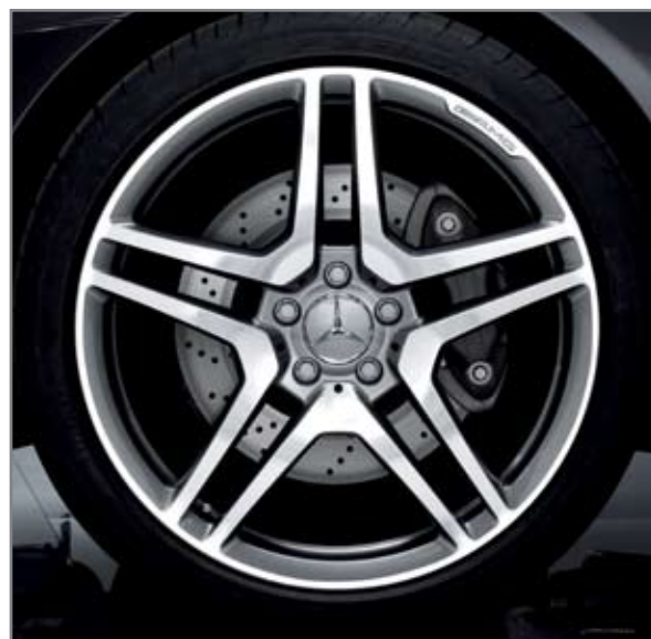
20" AMG Double-Spoke Forged Aluminum Wheels