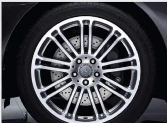
NEW Optional R85 19" 9-Twin-Spoke Wheel