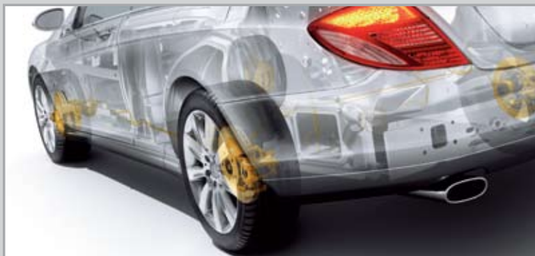
PRE-SAFE ® Braking with Distronic PLUS