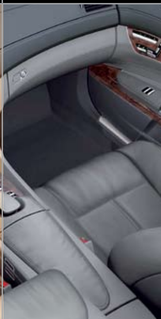
GREY/DARK GREY UPHOLSTERY WITH DARK BURL WALNUT TRIM