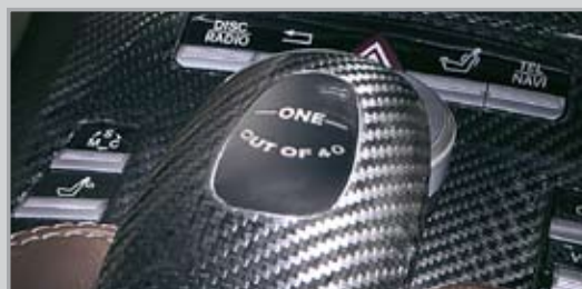
“40th Anniversary Edition” Badge and Carbon Fiber Trim