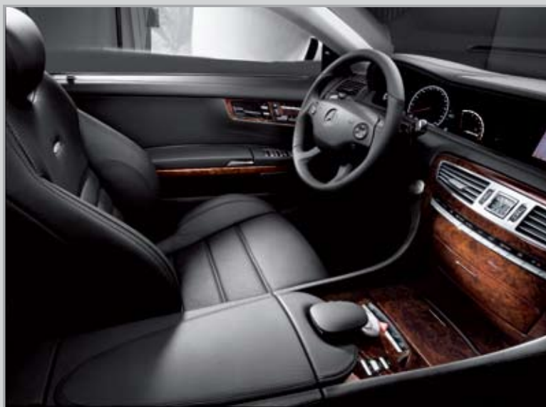
Premium Leather Upholstery with Gloss Dark Burl Walnut Wood Trim