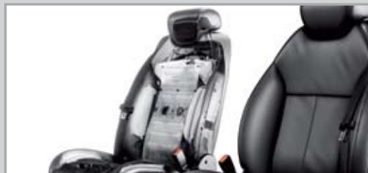
Drive-Dynamic Multicontour Front Seats