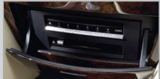
6-Disc DVD Changer and Memory Card Slot