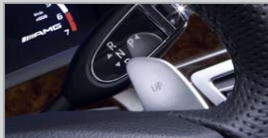
AMG Aluminum Shift Paddles