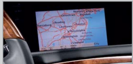
20GB Hard Drive-Based Navigation System