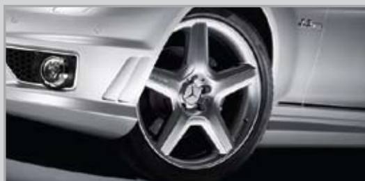
20" AMG 5-Spoke Aluminum Wheels