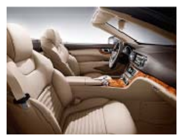
805 - Brown/Beige