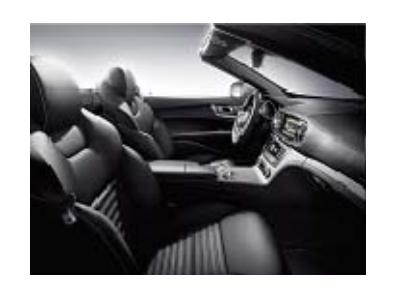
801 - Black