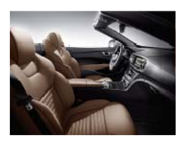
804 - Brown/Black