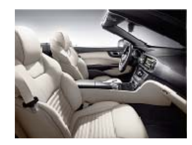
815 - Porcelain/Black

Premium Leather (80x) includes sun-reflecting premium leather on seats, armrests and center console with contrast stitching and piping