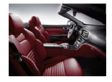
807 - Red Black